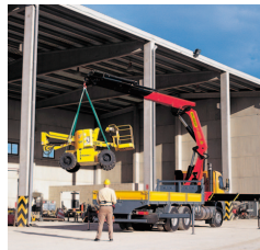
Scanreco in action

MaxiThe Maxi control unit can also be provided with 2 or 3 joysticks at a universal and variable speed with X/Y-axis or with Z-axis (2-0-2 / 2-2-2 / 2-3-2 / 3-2-3).